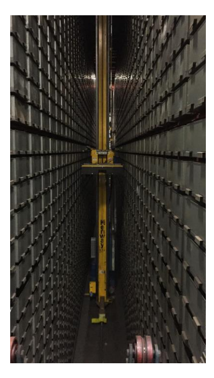
Figure 3 – CMF Mini-Load System<sup>14</sup>