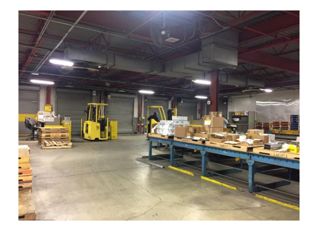
Figure 1 – CMF Receiving Dock