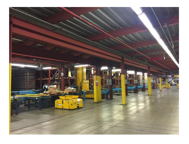
Figure 2 – Automated Guided Vehicle System (AGVS)<sup>13</sup>