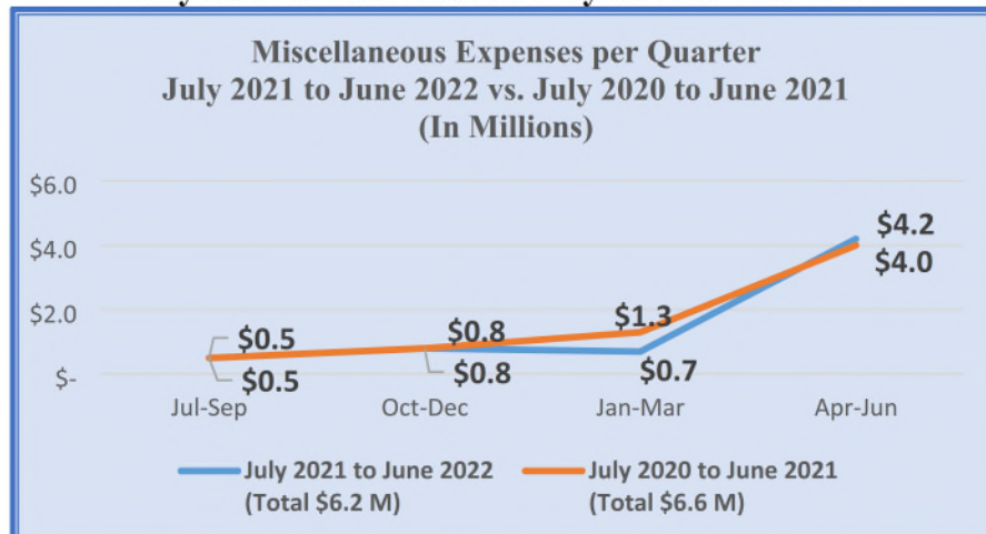
Figure 1: Miscellaneous Expenses per Quarter July 2021 to June 2022 vs. July 2020 to June 2021

Miscellaneous expenses of $6.2 million for FY 22 posted a decrease of $400,000 or 6% as compared with $6.6 million in FY 21. This was mainly due to lower advertising expenses of $3.5 million in the current fiscal year as compared with $4 million in the prior fiscal year. See Figure 1.