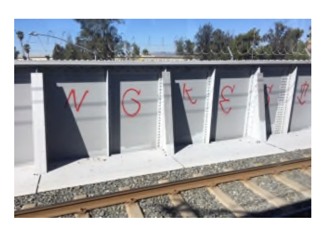
Figure 2. Paint-Out Graffiti Tags On the Gold Line for 6 Days

<u>Paint-Out Graffiti Tags Were Not Reported.</u> Paint-out type graffiti tags found on sections of the Gold Line on Wednesday, January 23<sup>rd</sup> had not been removed by Monday, January 29<sup>th</sup>. (See Figure 2 below for examples.) We confirmed with the Metro PM that the Contractor had not reported any paint-out tags to him during that week. Two members of the graffiti abatement team told us that they do not report paint-out graffiti tags to their supervisors because they believed it was not their responsibility to do so.