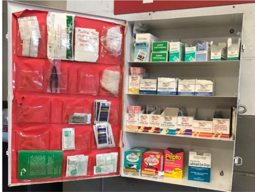
See Table 8 for the summary of the check result.