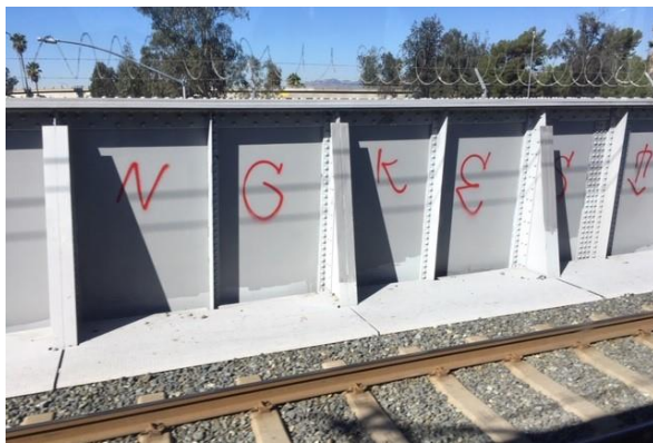
Figure 2. Paint-Out Graffiti Tags On the Gold Line for 6 Days

Paint-Out Graffiti Tags Were Not Reported. Paint-out type graffiti tags found on sections of the Gold Line on Wednesday, January 23 rd had not been removed by Monday, January 29 th . (See Figure 2 below for examples.) We confirmed with the Metro PM that the Contractor had not reported any paint-out tags to him during that week. Two members of the graffiti abatement team told us that they do not report paint-out graffiti tags to their supervisors because they believed it was not their responsibility to do so.